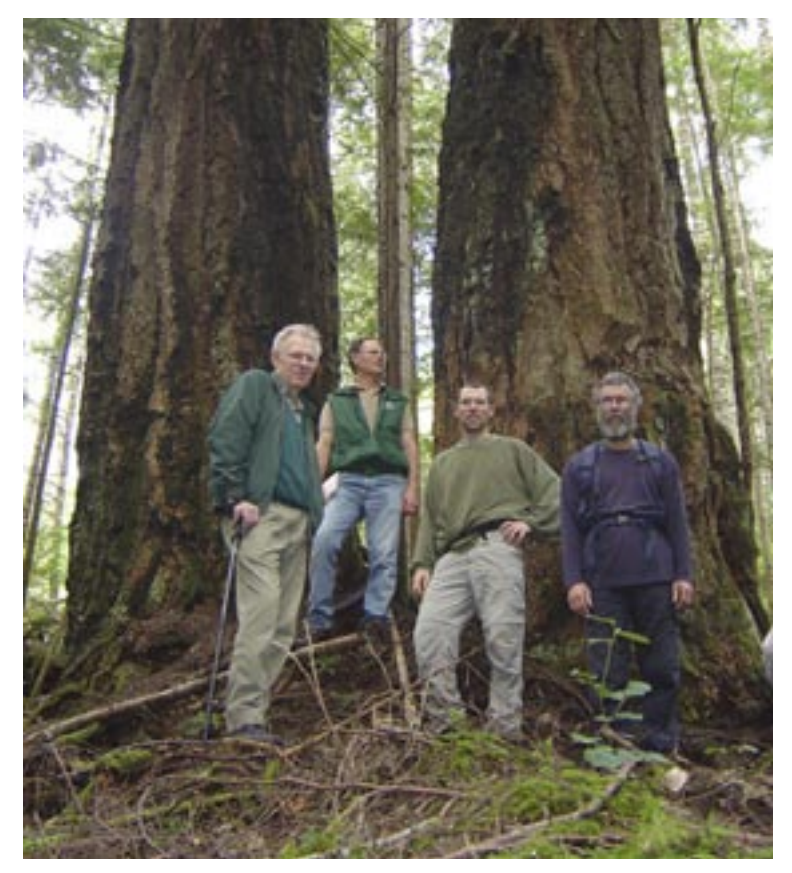
Members of the Bear Bay Alliance pose in front of the "Two Towers", mature Douglas Firs.

frog breeding. We hug huge Douglas fir and cedar, noting the black marks from old forest fires. There are brief glimpses of Sakinaw lake lapping the shore just below us. And close to the end of the trail sits that big, rusty, old donkey engine that seems to whisper, "I stayed here to protect this land." We hope so.