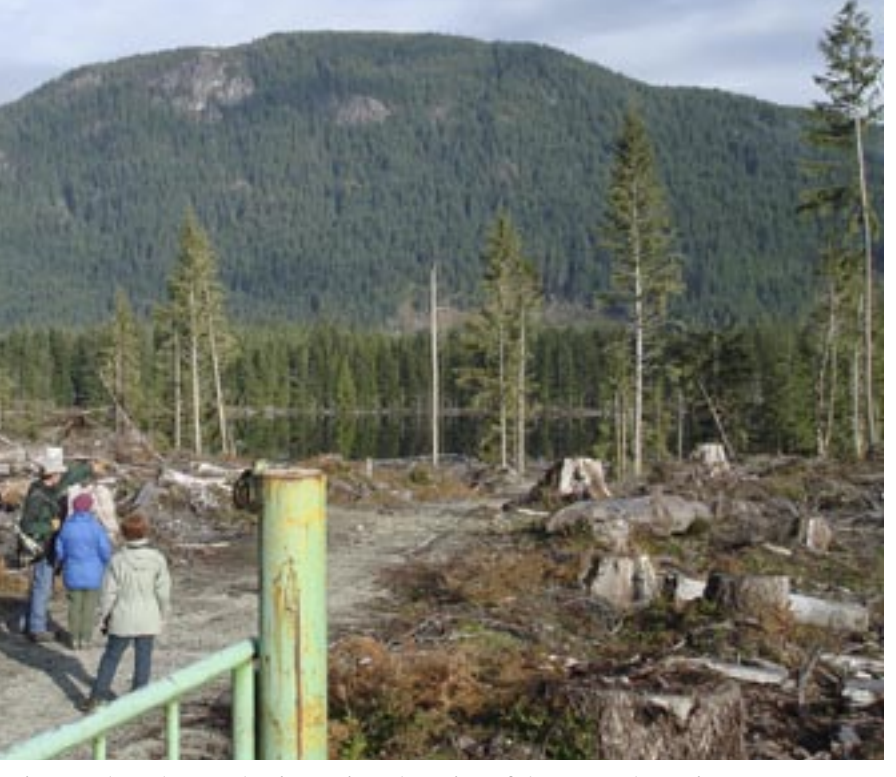
Dismayed outdoor enthusiasts view the ruins of the Horseshoe River portage, logged to the shoreline by Island Timberlands.

"Island Timberlands claims to conduct their operations