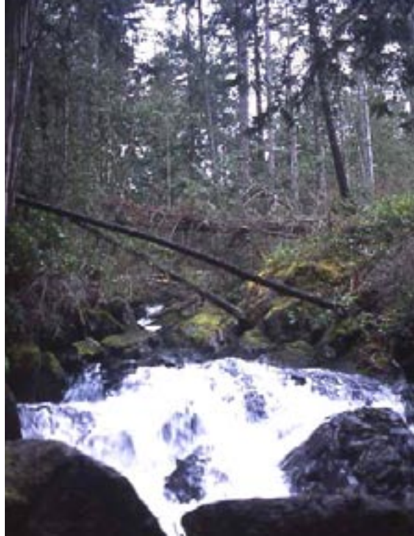
Homesite Creek with blowdown damage clearly visible from previous logging operations.