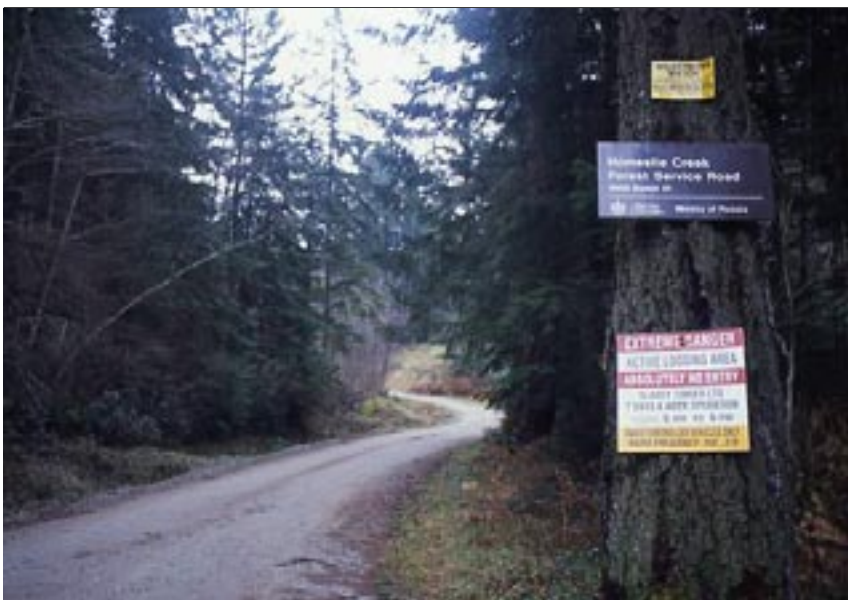
The Homesite Creek Forest Service Road leads from Highway 101 to some of the best hiking and biking areas on the Sechelt Peninsula.