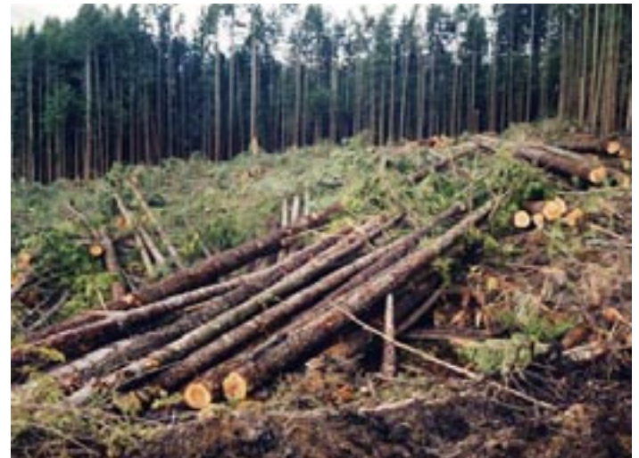
Recent logging in the Chapman Creek watershed area by AJB Investments Ltd. of West Vancouver.

Protect Our Community Watersheds: Residents have the right to an adequate supply of clean and safe drinking water. The Sunshine Coast’s community forests must respect the community’s legitimate desire for local control and authority to protect