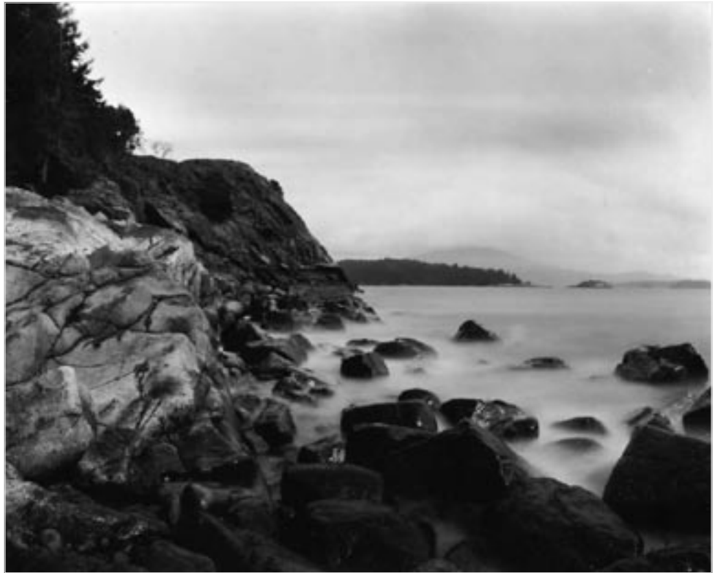
Pinhole camera image of Gospel Rock in Gibsons, with Keats Island and Vancouver's North Shore mountains in the background.

practices. We also strongly encourage foresters to maintain the high standards of ethical conduct and professional practice outlined in the association's bylaws. In our complaint we documented the manner that forestry was actually being practised, primarily with regard to the conservation of critical habitat. Essentially, we have asked the ABCFP to determine if these practices meet their standards. This is an ethical question that only the ABCFP can answer. In the end we expect that the ABCFP will not be able to avoid answering our questions. Members of the public,