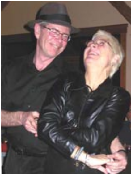
The mysterious dancing hombre with the hat gave the gals a whirl.

The SCCA's annual fundraiser and celebration of conservation was held in late November at Sechelt's Seaside Centre. The theme for 2004 was marine protection, and we decided to name the evening social event the Ocean Commotion. The entire day was a great success, raising funds and awareness not only for the SCCA but also for marine protection and Sunshine Coast conservation in general. The directors of the SCCA wish to thank all volunteers and silent auction donors for their generous contributions. Thanks also to all the participants. We trust you had a good time! ☺ The daytime portion of the event featured a series of afternoon presentations on the science and theory